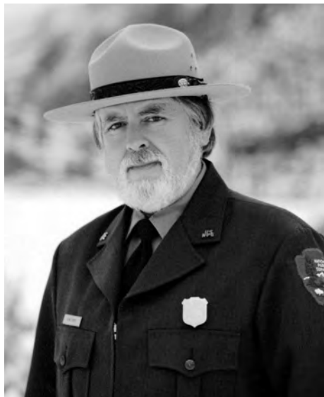
Terry Family Photo