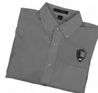
Men's Dress Shirt