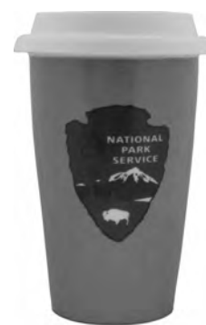
Ceramic Travel Mug