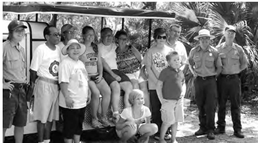
TEN VISITORS FROM VIRGINIA, GEORGIA AND FLORIDA were the first to take the new Lands and Legacies Tours at Cumberland Island NS on Aug. 11.