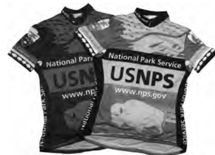
Men's and Ladies' Bike Jersey