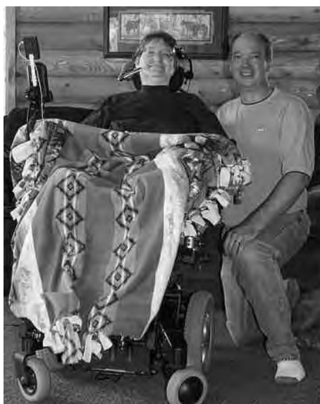
Custer Chronicle newspaper