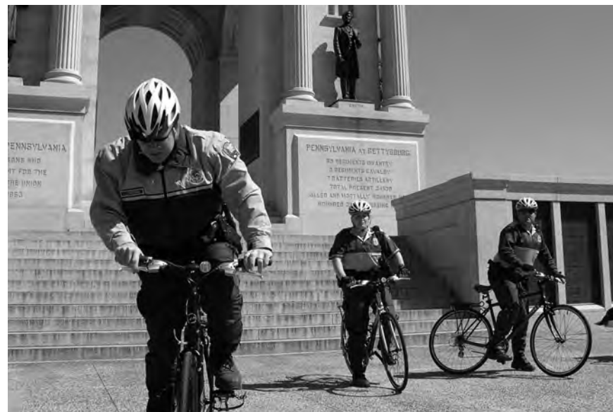
Gettysburg NMP