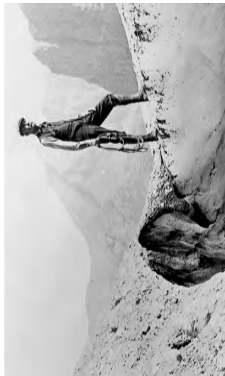
NPS GLACIER NP WAS ESTABLISHED ON MAY 11, 1910 as the nation's 10th national park, and the park is preparing to celebrate its 100th anniversary in 2010. There were many people who were pivotal in the establishment and early tourist development of the park, such as author and naturalist George Bird Grinnell, shown here standing on Grinnell Glacier with rope in hand. Today, there are 10 times as many people (if not more) preparing to celebrate the history and plan for the future of Glacier NP. See information on upcoming events for this centennial on page seven.