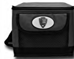
Insulated Lunch Bag