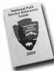
Pocket Reference Guide

To order, visit www.ArrowheadStore.com , or call (877) NAT-PARK