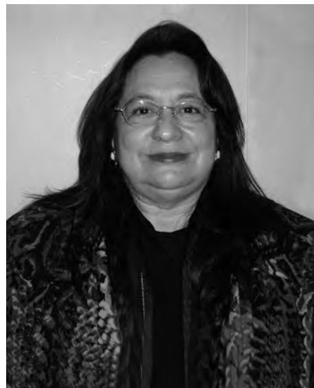
Vaden Family Photo

Area in New Jersey. In 2009, the North Jersey American Revolution Round Table named him "Man of the Year."