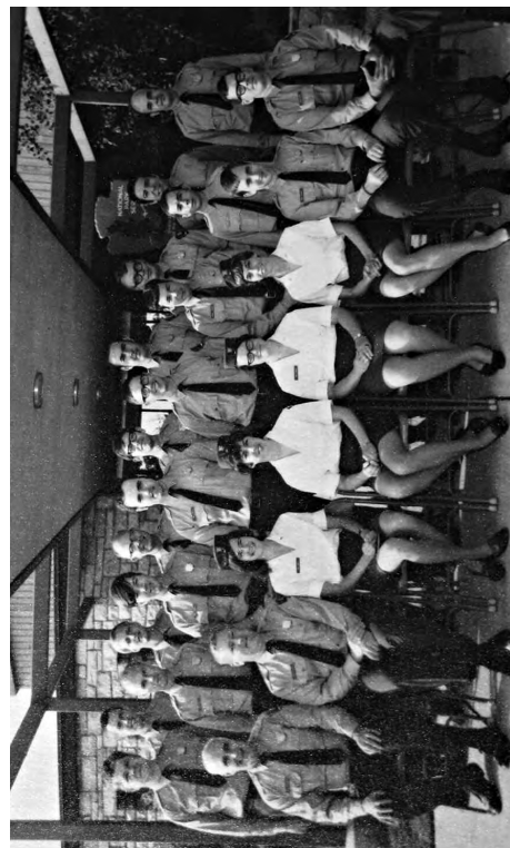
SHENANDOAH NP'S INTERPRETIVE STAFF , summer 1970. Recognize anyone in this photo? If so, be sure to let them know about Shenandoah NP's employee reunion on May 14 and 15, 2011. In celebration of its 75th anniversary, Shenandoah NP will honor past and present employees with a weekend full of activities, programs and fellowship. To see more Shenandoah alumni photos, get information on the weekend's activities and to register, visit www.CelebrateShenandoah.org/reunion .

Arrowhead The Newsletter of the Employees & Alumni Association of the National Park Service 470 Maryland Drive, Suite 1, Fort Washington, PA 19034